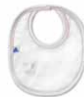
Bibs. Double-layered in terry cotton