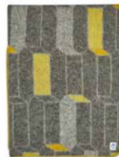
HARPA BLANKET 100% icelandic wool. Size: 140 x 100 cm