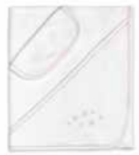
Towel set. Size 100 x 100 cm