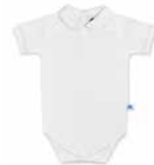
Chic Body. Size 0 - 12 months