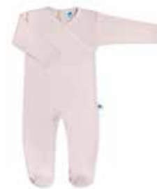
Footies. Size: 0 -12 months