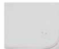
Blankets. Size: 100 x 100 cm